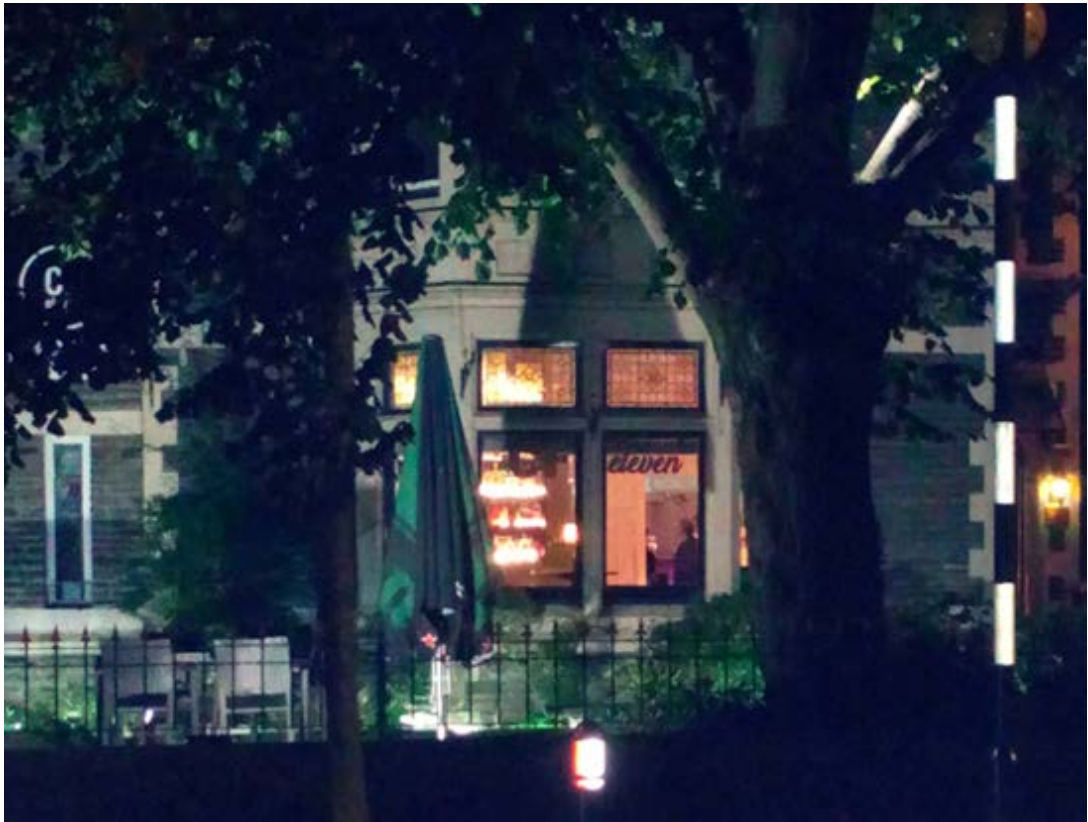
Umbrellas up, beer garden , customers in new front bar area (no planning in place)